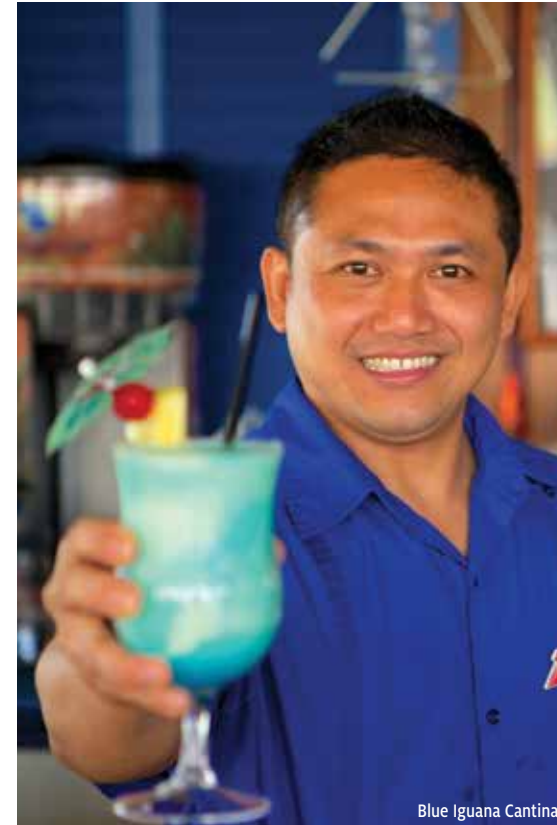
Blue Iguana Cantina